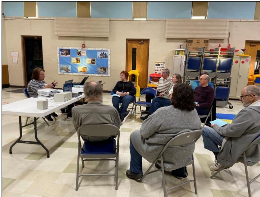
CAMUG Meeting – March 21, 2022